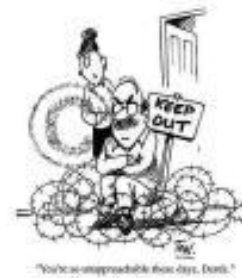
"You're so unapproachable these days, Dore!"

One party gives more, Not all options explored, Breed resentment, Form of lose/lose